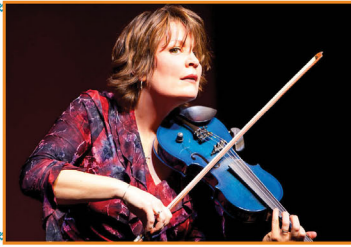
The Kick off to St. Francis de Sales

Performing live in ST. FRANCIS DE SALES CHURCH 148 W Main St, Lake Geneva, WI Saturday, September 26th, 7:30pm with a virtual option available