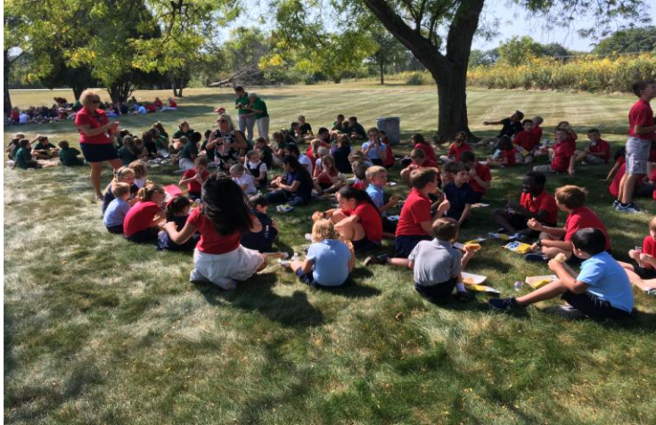
Students and staff enjoying lunch at the Walworth County Catholic Schools Mass and Picnic.